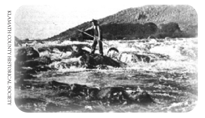
Photo 2. Link River salmon "fishing" around 1860. Site of present Klamath Falls.

BLM et al. (1995) includes a photo captioned "Fishing for steelhead on Spencer Creek...around 1900" from the photo collection of the Anderson Family, descendents of Hiram Spencer, an early settler in the Spencer Creek area. Fortune et al. (1966) cited a brochure from Southern Pacific Railroad, published in 1911, that referred specifically to the harvest of steelhead at the mouth of Shovel Creek (Figure 1).