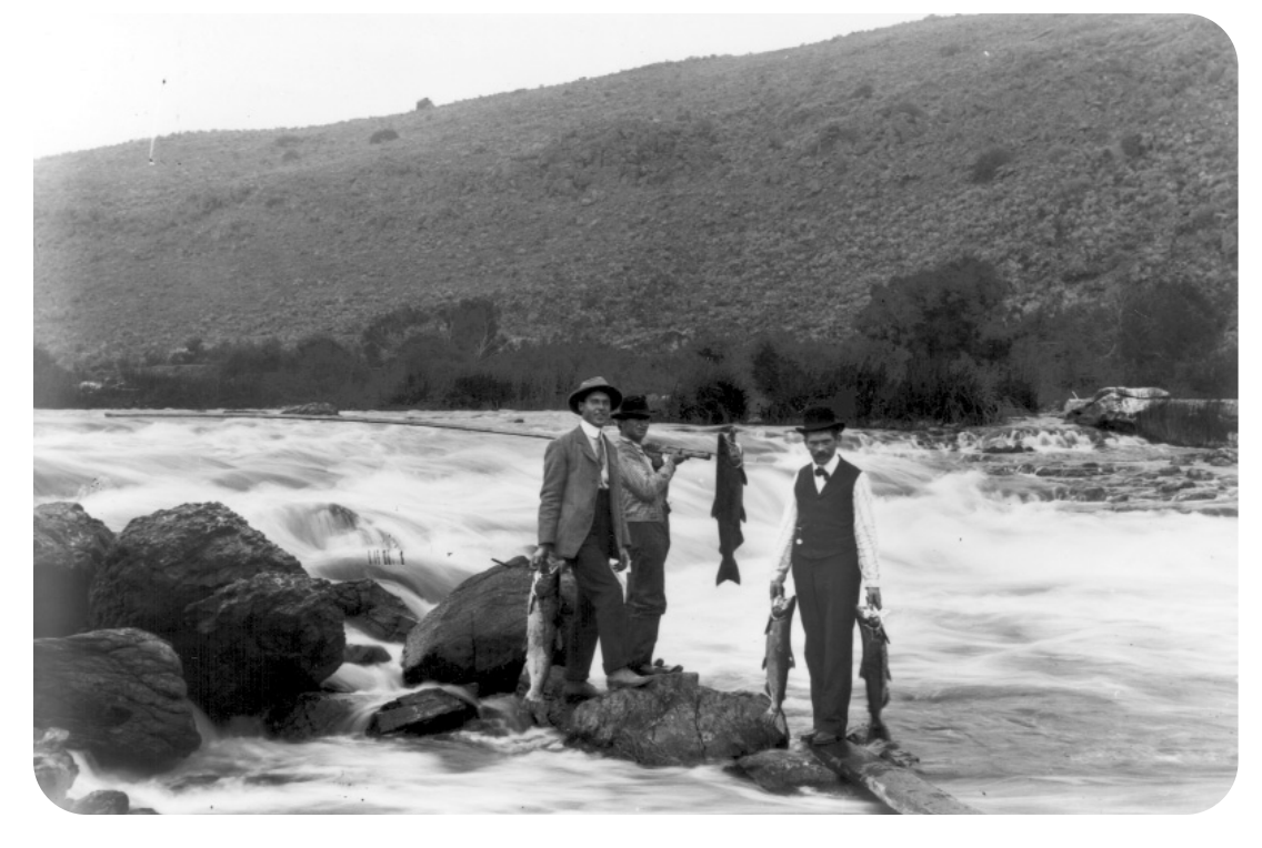
Photo 3. Gentlemen display their catch while salmon fishing on the rapids of Link River, 1891.